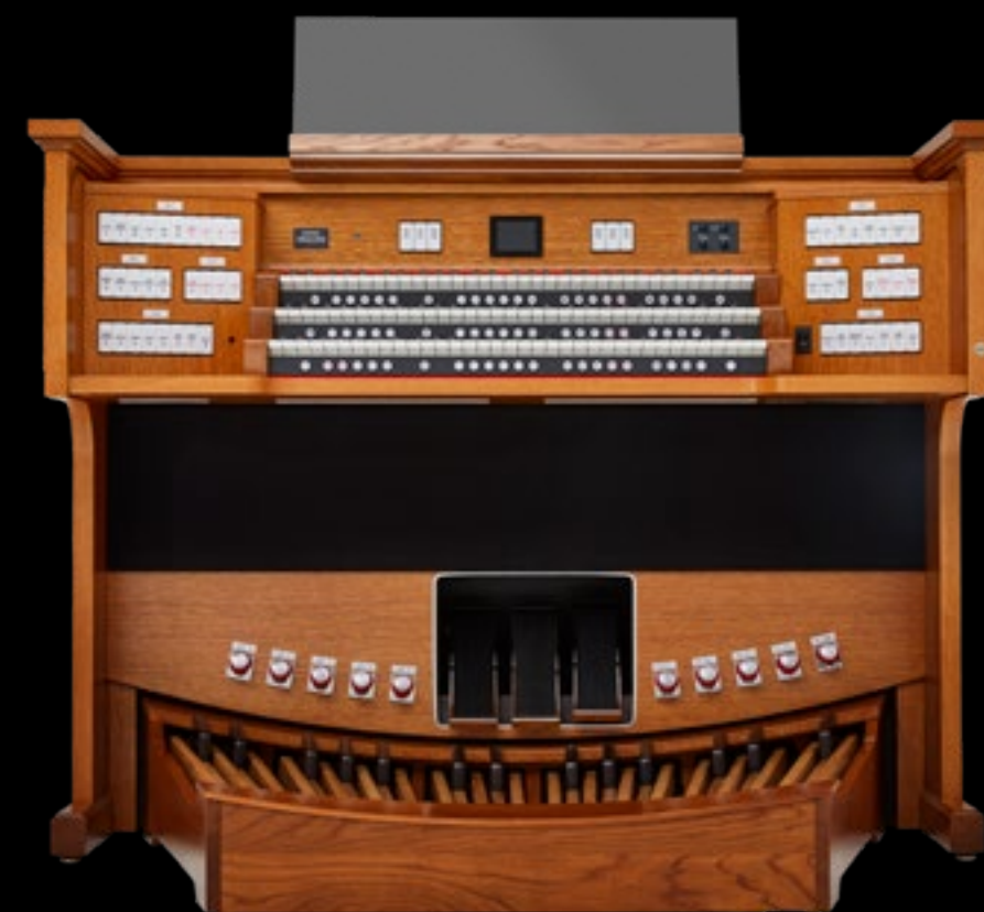
IMAGINE SERIES 351T