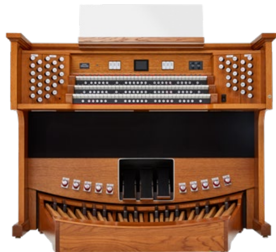
IMAGINE SERIES 351D